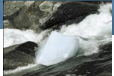
Exact injection - precise temperature